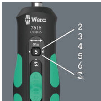
Five selectable tightening torques (2.0; 3.0; 4.0; 5.0; 6.0 Nm) and one fixed position (Torque Lock) for unlimited tightening and loosening moments.