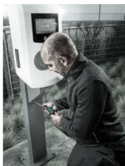
Torque screwdriver with quick torque adjustment