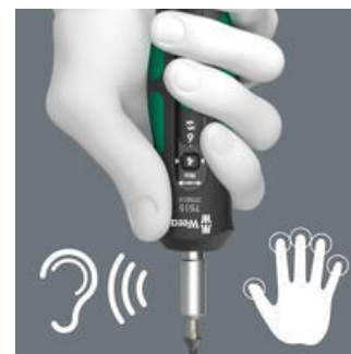
Distinctly audible and noticeable excess-load signal when the pre-set torque is reached.