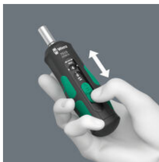
Easy setting of the selectable tightening torques.